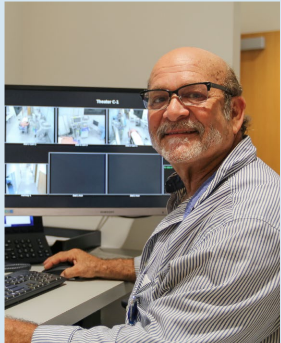
Michael L. Di Lena Center for Experiential Learning & Simulation UF College of Medicine

Created the UF Data Guide online tool, helping staff make informed decisions about how and where to safely store, analyze, and share data. Launched in January 2019, the Guide has been accessed nearly 1,900 times.